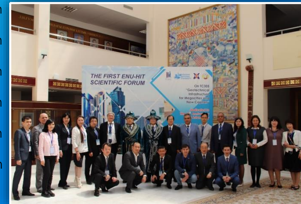
Commemorative photo of the First ENU-HIT Scientific Forum